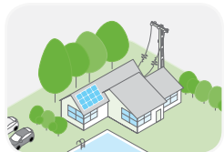
Residential grid-tie solar with backup power